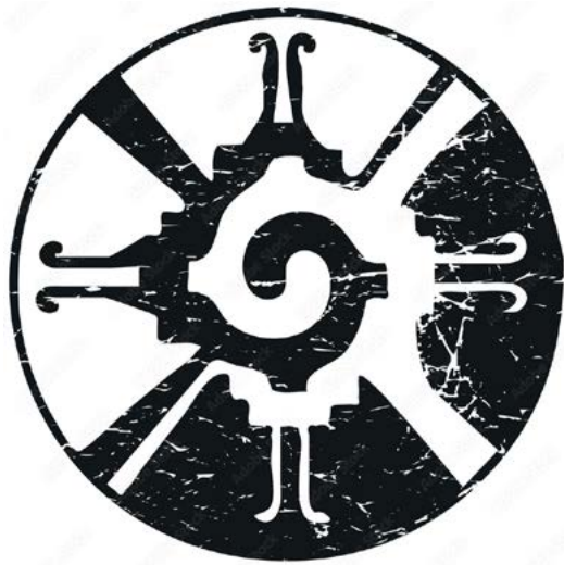
Fig. 3- Spiral symbol =Maya Supreme Being, Hunab Ku. https://en.wikipedia.org/wiki/Hunab_Ku

the spiral symbols would represent the fertility of the Mother Goddess and her ability to power the cycle of rebirth (Fig. 1—left=red Mother Goddess).