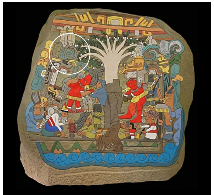
Fig. 1 - Izapa, Mexico Stela 5