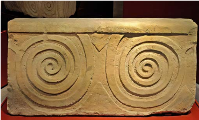
Fig. 2 - Spirals decorate an ancient tomb-Israel.

In some ancient cultures, spirals were used to decorate tombs (Fig. 2). While nobody can be sure of the exact reason, it's theorized that these tombs were viewed as a kind of womb in the Earth. In this case,