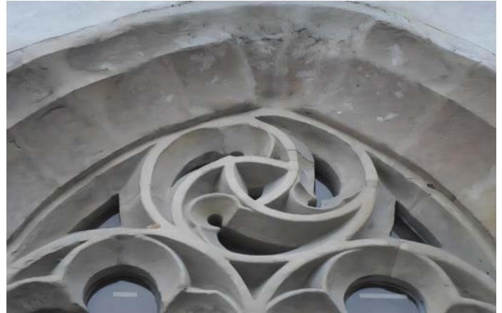
Fig. 4- Triskèle Saint-Marcellin (in Isère / France) https://journeysoflife.com/spiral-spiritual-meaning/

Human lives are said to follow paths similar to spirals. As such, the Spiral of Life is a representation of human existence as a process of growth, progress, and transformation.