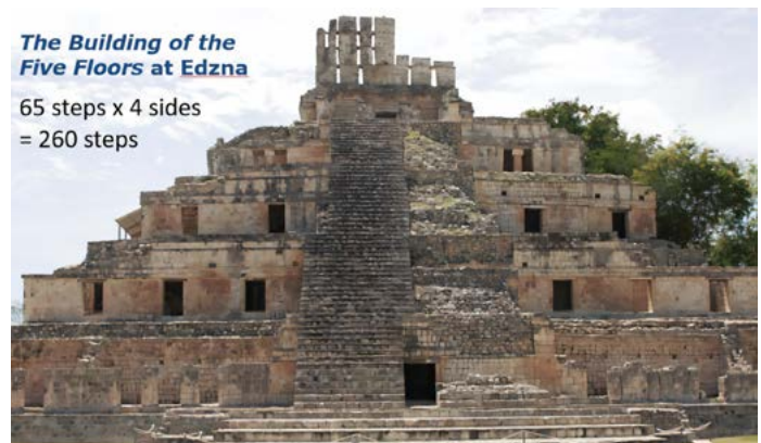
Fig. 3- The Building of the Five Floors at Edzna, Campeche, est. 7th century AD - Late Classic Maya

Among contemporary Maya, women still associate the 260 sacred calendar with the nine-month period of human gestation. vii