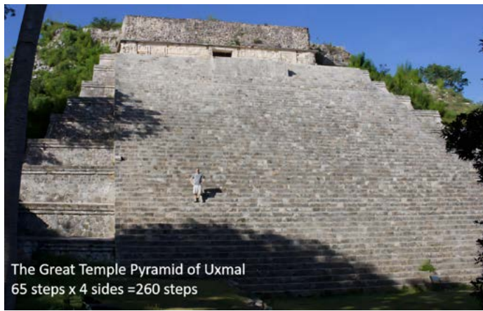
Fig. 2- The Great Temple Pyramid of Uxmal, Yucatan, est. 7th century AD – Late Classic Maya (1843/196)

Mesoamerica and is known as the sacred calendar because it structured the pattern of ceremonial life and provided the foundations for prophecy. ii