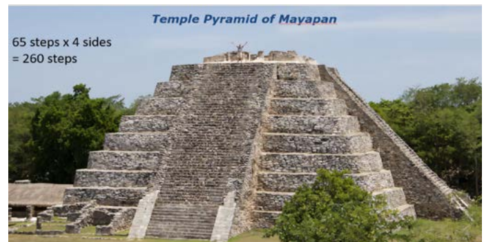
Fig. 4- Temple Pyramid of Mayapan, Yucatan, est. 1200 AD - Post Classic Maya