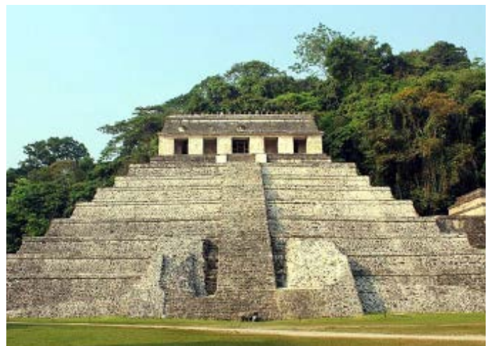
Fig. 1 - Palenque, Chiapas, Mexico “Temple of the Inscriptions”

Linda Schele became an Art professor at the University of Texas in Austin. She published books on her research and won many awards for her work in translating the Maya writing system. Her most famous book, co-authored with David Freidel, is “Forest of Kings” (1990).