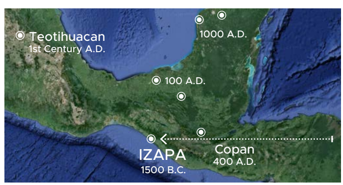
Fig. 1 - Maya 260-Day Calendar began at Izapa, Mexico (1500 BC & 550 BC to 1000 AD) at 15° N. Latitude + Antiquities built with Middle Eastern Cubits.

In the Sacred Maya Temple Ceremony, the Elders tell of babies coming from Heaven. As they grow and live on the earth they are taught by their parents to do good. They are tempted by the adversary. But as they live their lives the way their parents have taught them, when they die, their spirits are resurrected back into heaven from whence they came, to live with their ancestors.