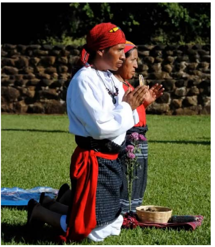
Fig 2. Two Maya parents praying on behalf of their descendents in the Sacred Mayan temple ceremony at Izapa.

2024. Ancient America Foundation. All rights reserved. www.ancientamericafoundation.org