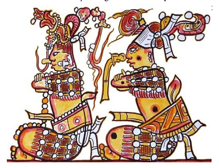
Fig. - 3- Tonsured Maize God and Spotted Hero Twin

The Popol Vuh is of particular importance given the scarcity of early accounts dealing with Mesoamerican mythologies. After the Spanish