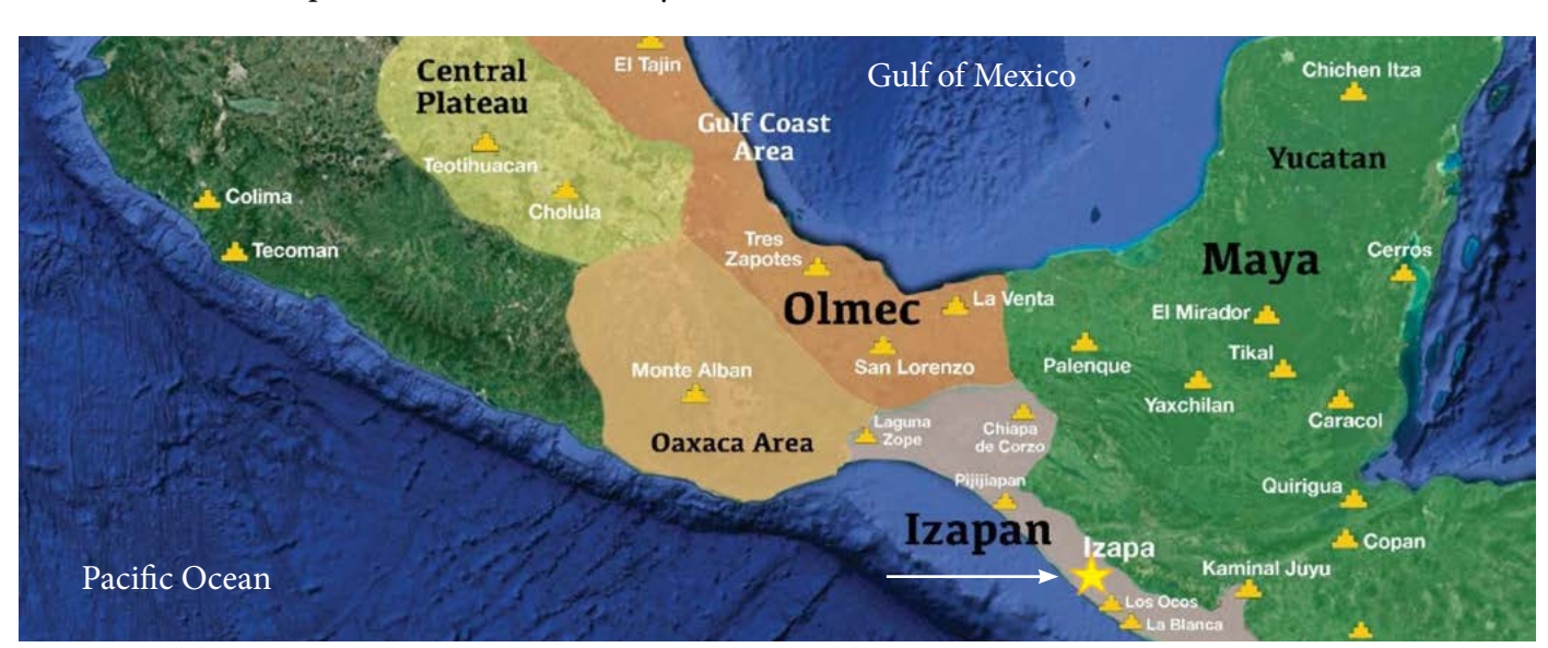
Fig. 2 - The Star = Izapa, Chiapas, Mexico is located at 14.8° N. Latitude near where the Popol Vuh was recorded (Google Earth Map)

of the carved monuments at Izapa's Temple depict subjects described in the Popol Vuh . The Popol Vuh encompasses a range of subjects that include creation, history, cosmology, and ancestry. Its "Preamble" includes the purpose for writing the Popol Vuh , and the measuring of the earth. There are essentially 4 divisions in this sacred book.