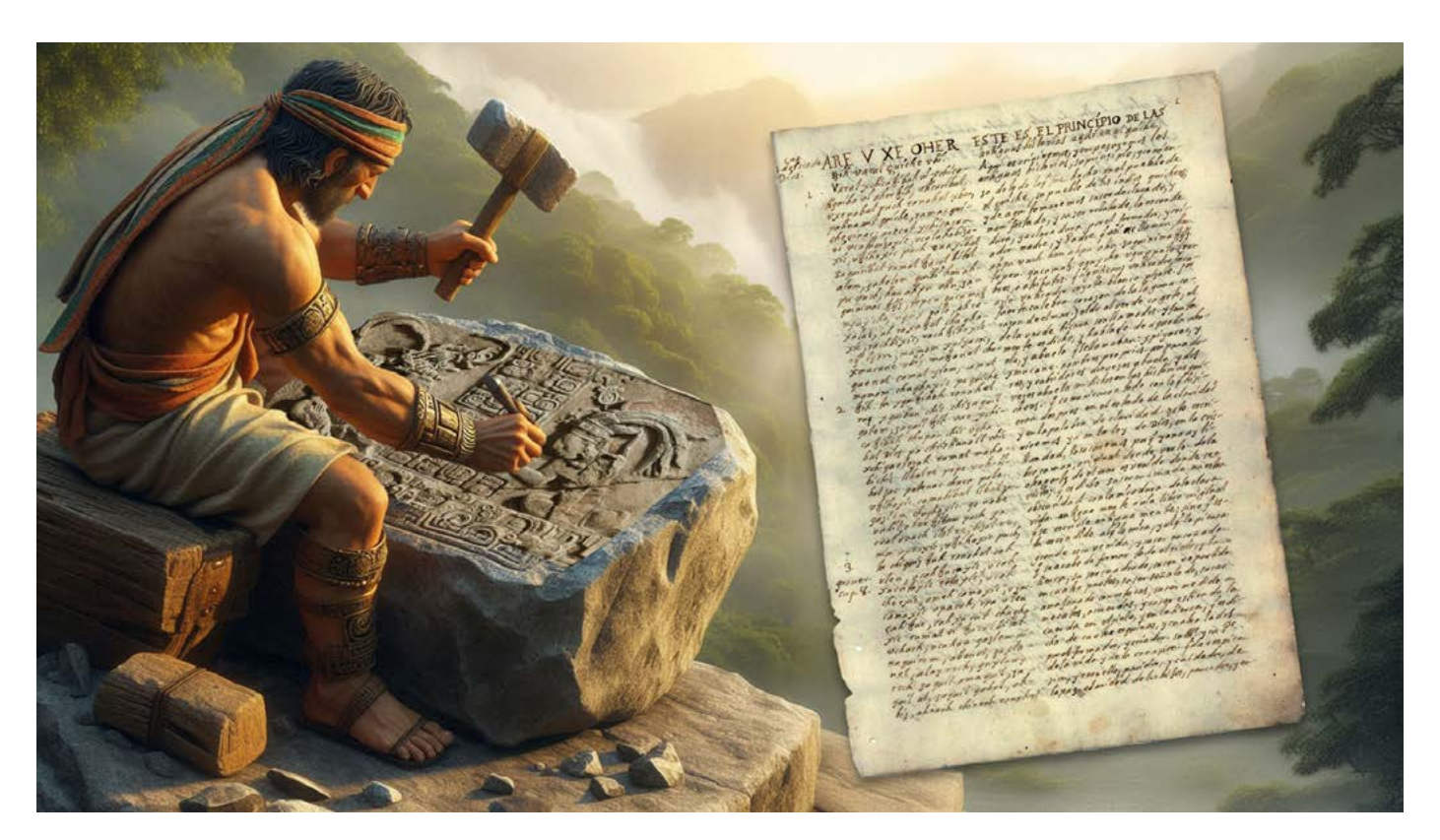
Fig. 1 - The oldest surviving written account of the Popol Vuh (ms c. 1701 by Francisco Ximénez, O.P.). The parallel columns are: Left—K'iche' Maya, Right—Spanish translation.