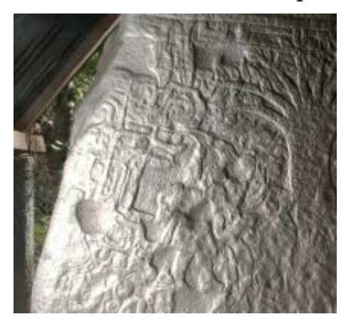
Fig. 2 - Stela 5 -Upper Left