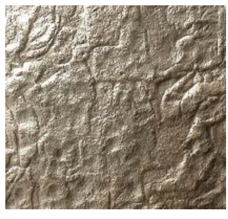
Fig. 3 - Stela 5 Middle of Tree with the God figure on the right.