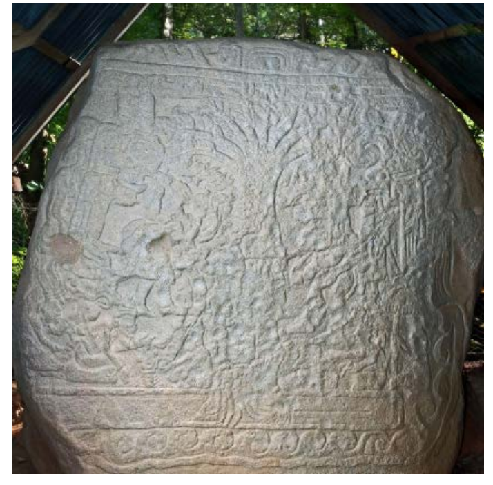
Fig. 1 - 2012 RTI Photo of Izapa, Mexico's Stela 5 "Tree of Life".

The video shows that the "artistic" renditions by others do not display what the years of photos and the new RTI photos show.