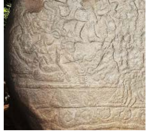
Fig. 4 - Stela 5 Lower Left: ancestral Izapa Family members.